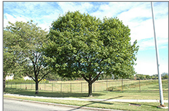
Norway Maple