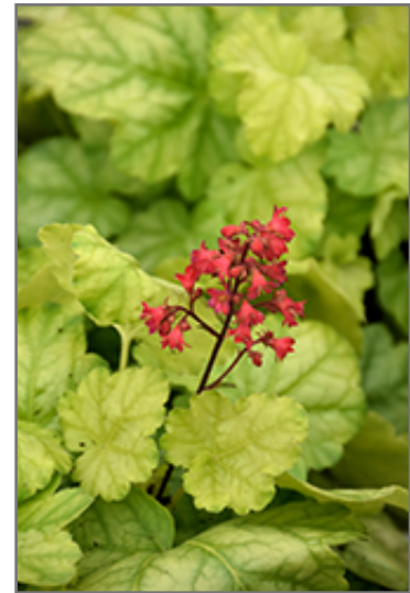
Tokyo Coral Bells flowers

Tokyo Coral Bells is recommended for the following landscape applications;