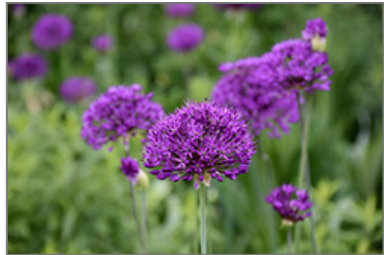
Purple Sensation Ornamental Onion flowers

Purple Sensation Ornamental Onion will grow to be about 12 inches tall at maturity extending to 3 feet tall with the flowers, with a spread of 12 inches. It grows at a medium rate, and under ideal conditions can be expected to live for approximately 5 years. As this plant tends to go dormant in summer, it is best interplanted with late-season bloomers to hide the dying foliage.