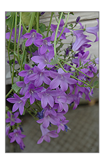
Birch Hybrid Bellflower flowers