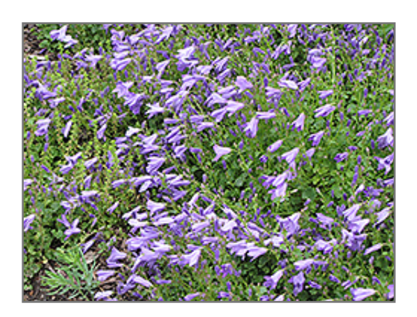
Birch Hybrid Bellflower in bloom