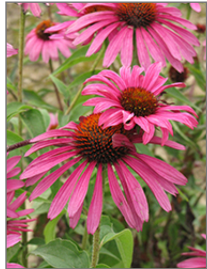
Ruby Star Coneflower flowers

Ruby Star Coneflower is recommended for the following landscape applications;