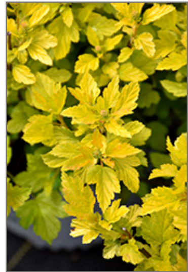
Tiny Wine Gold Ninebark foliage

Tiny Wine Gold Ninebark is recommended for the following landscape applications;