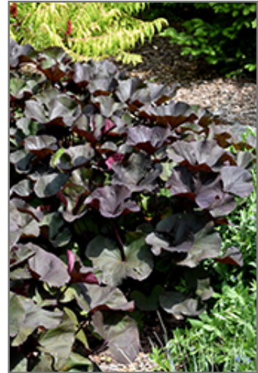
Britt Marie Crawford Rayflower foliage

This plant does best in partial shade to shade. It prefers to grow in moist to wet soil, and will even tolerate some standing water. It is not particular as to soil pH, but grows best in rich soils. It is somewhat tolerant of urban pollution. This is a selected variety of a species not originally from North America. It can be propagated by division; however, as a cultivated variety, be aware that it may be subject to certain restrictions or prohibitions on propagation.