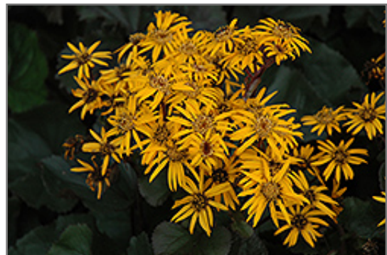
Britt Marie Crawford Rayflower flowers