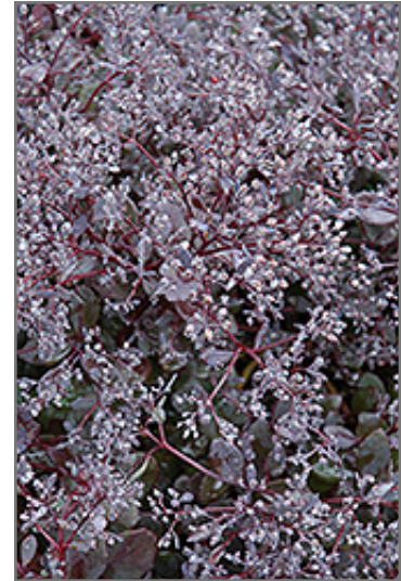
Bertram Anderson Stonecrop flowers

Bertram Anderson Stonecrop is recommended for the following landscape applications;