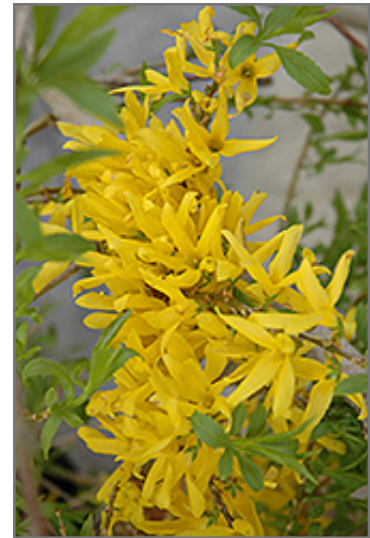
Gold Tide Forsythia flowers

Gold Tide Forsythia is recommended for the following landscape applications;