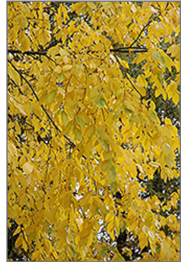
American Elm in fall

This tree should only be grown in full sunlight. It is an amazingly adaptable plant, tolerating both dry conditions and even some standing water. It is not particular as to soil type or pH, and is able to handle environmental salt. It is highly tolerant of urban pollution and will even thrive in inner city environments. This species is native to parts of North America.