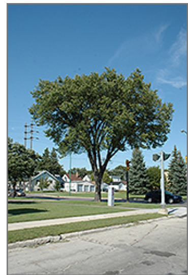
American Elm