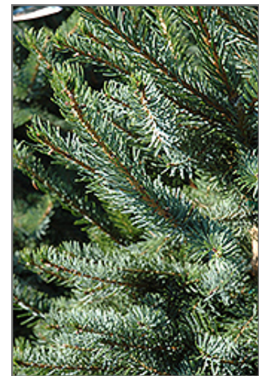
Brun's Spruce foliage