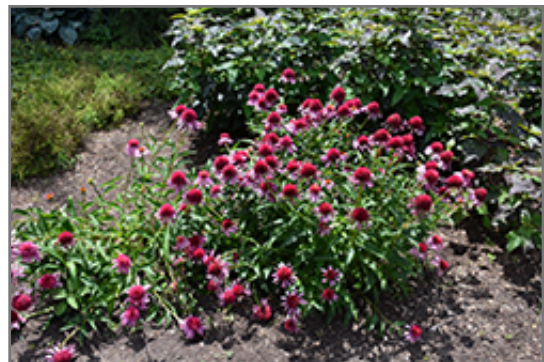
Double Scoop Bubble Gum Coneflower in bloom