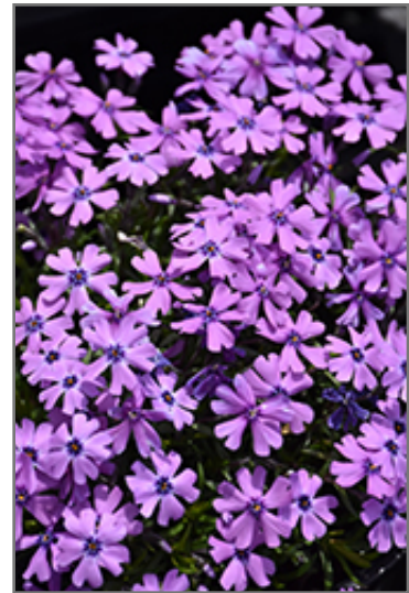
Purple Beauty Moss Phlox flowers