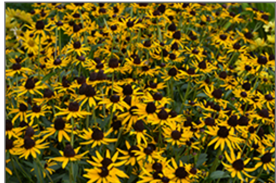
Little Goldstar Coneflower flowers