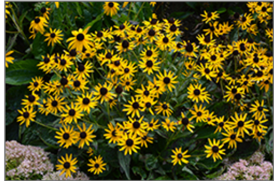
Little Goldstar Coneflower in bloom

This is a relatively low maintenance plant, and should be cut back in late fall in preparation for winter. It is a good choice for attracting butterflies to your yard, but is not particularly attractive to deer who tend to leave it alone in favor of tastier treats. It has no significant negative characteristics.