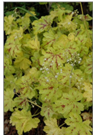
Solar Power Foamy Bells flowers