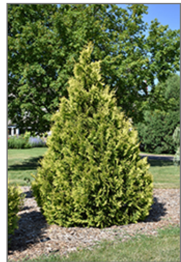
Yellow Ribbon Arborvitae