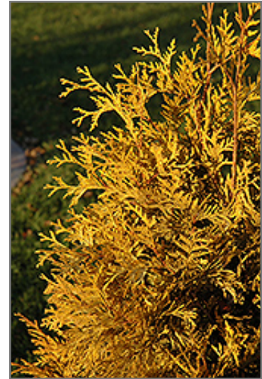
Yellow Ribbon Arborvitae in fall

This shrub does best in full sun to partial shade. It prefers to grow in average to moist conditions, and shouldn't be allowed to dry out. It is not particular as to soil type or pH. It is somewhat tolerant of urban pollution, and will benefit from being planted in a relatively sheltered location. Consider applying a thick mulch around the root zone in winter to protect it in exposed locations or colder microclimates. This is a selection of a native North American species.