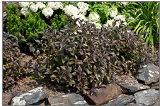
Tango Weigela

Tango Weigela makes a fine choice for the outdoor landscape, but it is also well-suited for use in outdoor pots and containers. With its upright habit of growth, it is best suited for use as a 'thriller' in the 'spiller-thriller-filler' container combination; plant it near the center of the pot, surrounded by smaller plants and those that spill over the edges. It is even sizeable enough that it can be grown alone in a suitable container. Note that when grown in a container, it may not perform exactly as indicated on the tag - this is to be expected. Also note that when growing plants in outdoor containers and baskets, they may require more frequent waterings than they would in the yard or garden. Be aware that in our climate, most plants cannot be expected to survive the winter if left in containers outdoors, and this plant is no exception. Contact our experts for more information on how to protect it over the winter months.