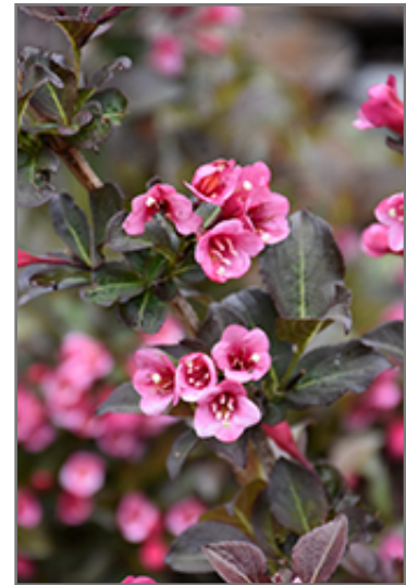
Tango Weigela flowers

Tango Weigela is recommended for the following landscape applications;