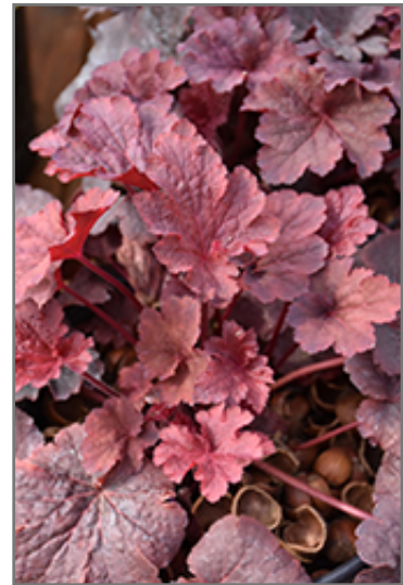
Cajun Fire Coral Bells foliage

Cajun Fire Coral Bells is recommended for the following landscape applications;