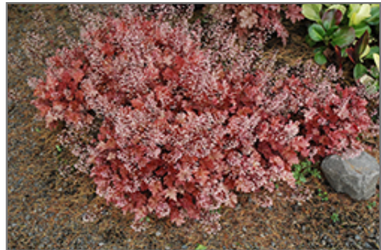
Peach Crisp Coral Bells in bloom

This is a relatively low maintenance plant, and should be cut back in late fall in preparation for winter. It is a good choice for attracting hummingbirds to your yard. It has no significant negative characteristics.