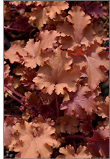
Peach Crisp Coral Bells foliage

Peach Crisp Coral Bells will grow to be about 14 inches tall at maturity extending to 20 inches tall with the flowers, with a spread of 18 inches. When grown in masses or used as a bedding plant, individual plants should be spaced approximately 15 inches apart. Its foliage tends to remain dense right to the ground, not requiring facer plants in front. It grows at a medium rate, and under ideal conditions can be expected to live for approximately 10 years. As an evergreen perennial, this plant will typically keep its form and foliage year-round.