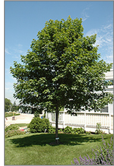
Fall Fiesta Sugar Maple

This tree should only be grown in full sunlight. It prefers to grow in average to moist conditions, and shouldn't be allowed to dry out. It is not particular as to soil pH, but grows best in rich soils. It is somewhat tolerant of urban pollution. This is a selection of a native North American species.