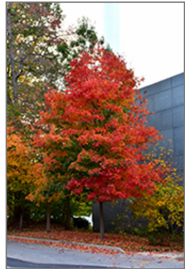
Fall Fiesta Sugar Maple in fall