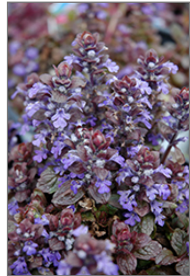
Bronze Beauty Bugleweed flowers