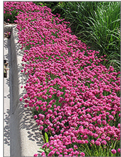
Dusseldorf Pride Sea Thrift in bloom

Dusseldorf Pride Sea Thrift is recommended for the following landscape applications;