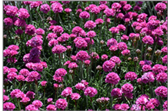
Dusseldorf Pride Sea Thrift flowers

Dusseldorf Pride Sea Thrift will grow to be only 6 inches tall at maturity extending to 8 inches tall with the flowers, with a spread of 8 inches. Its foliage tends to remain low and dense right to the ground. It grows at a slow rate, and under ideal conditions can be expected to live for approximately 10 years. As an evergreen perennial, this plant will typically keep its form and foliage year-round.