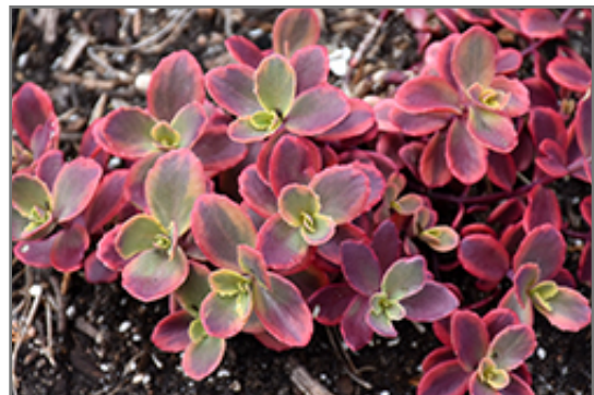
Sunsparkler Wildfire Stonecrop foliage