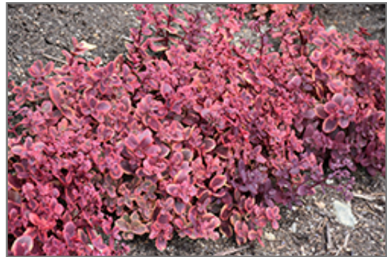
Sunsparkler Wildfire Stonecrop