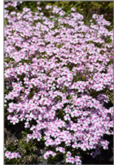
Coral Eye Moss Phlox flowers