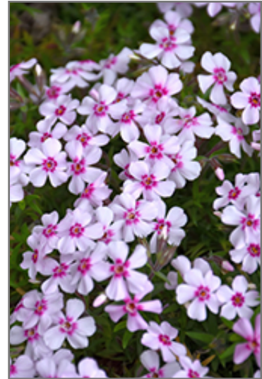
Coral Eye Moss Phlox flowers

Coral Eye Moss Phlox will grow to be only 4 inches tall at maturity, with a spread of 18 inches. When grown in masses or used as a bedding plant, individual plants should be spaced approximately 14 inches apart. Its foliage tends to remain low and dense right to the ground. It grows at a medium rate, and under ideal conditions can be expected to live for approximately 10 years. As an evergreen perennial, this plant will typically keep its form and foliage year-round.