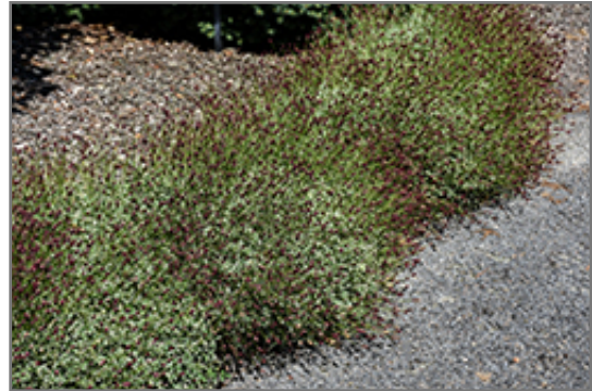
Little Angel Burnet in bloom