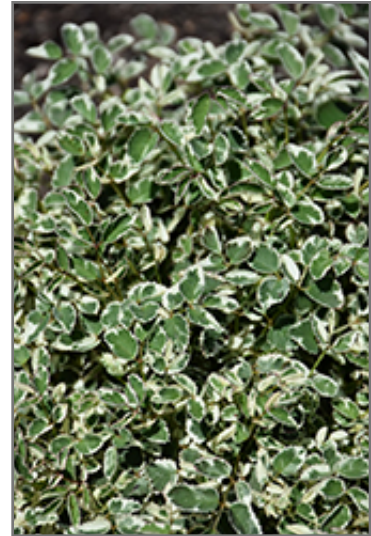
Little Angel Burnet flowers

Little Angel Burnet will grow to be only 4 inches tall at maturity extending to 10 inches tall with the flowers, with a spread of 14 inches. When grown in masses or used as a bedding plant, individual plants should be spaced approximately 12 inches apart. It grows at a medium rate, and under ideal conditions can be expected to live for approximately 15 years. As an herbaceous perennial, this plant will usually die back to the crown each winter, and will regrow from the base each spring. Be careful not to disturb the crown in late winter when it may not be readily seen!