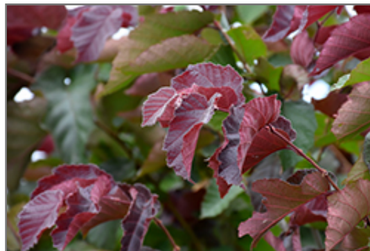
Purpleleaf Bailey Select American Hazelnut foliage