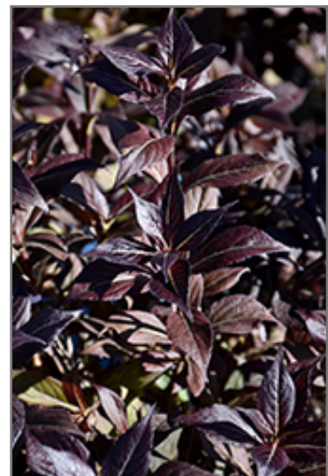
Date Night Stunner Weigela foliage