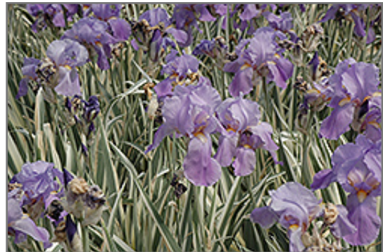
Variegated Sweet Iris flowers