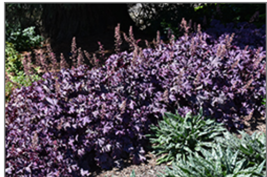
Grande Amethyst Coral Bells in bloom