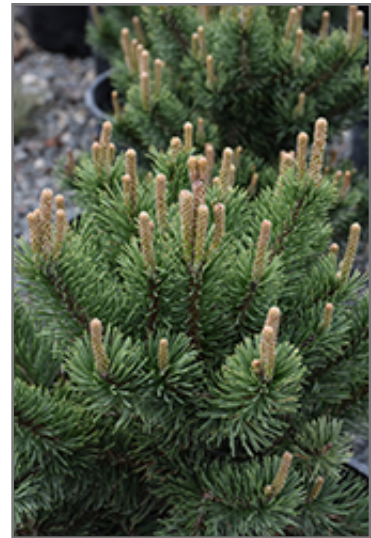
Lakeview Mugo Pine foliage