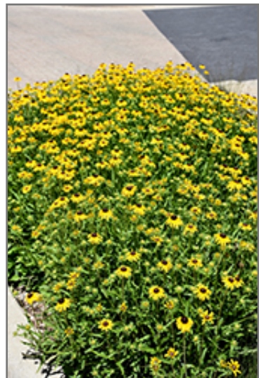
Viette's Little Suzy Coneflower in bloom