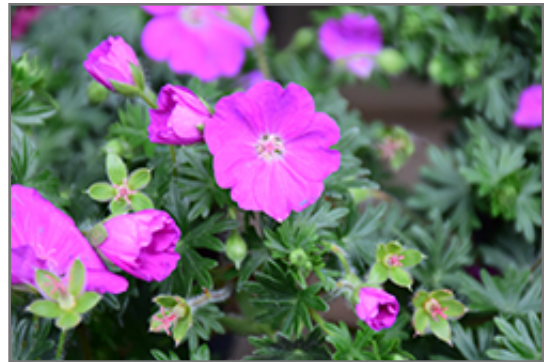
Max Frei Cranesbill flowers