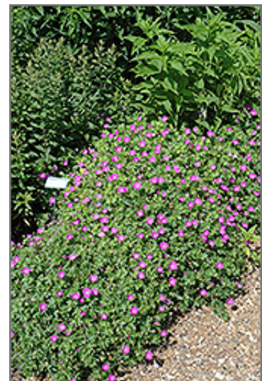
Max Frei Cranesbill in bloom