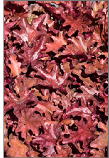
Peach Flambe Coral Bells foliage

This is a relatively low maintenance plant, and should be cut back in late fall in preparation for winter. It is a good choice for attracting hummingbirds to your yard. It has no significant negative characteristics.