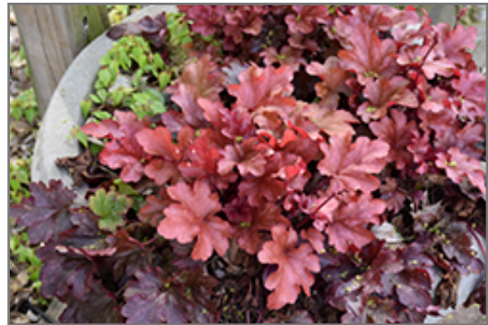
Peach Flambe Coral Bells

Peach Flambe Coral Bells is a fine choice for the garden, but it is also a good selection for planting in outdoor pots and containers. It is often used as a 'filler' in the 'spiller-thriller-filler' container combination, providing a mass of flowers and foliage against which the larger thriller plants stand out. Note that when growing plants in outdoor containers and baskets, they may require more frequent waterings than they would in the yard or garden. Be aware that in our climate, most plants cannot be expected to survive the winter if left in containers outdoors, and this plant is no exception. Contact our experts for more information on how to protect it over the winter months.