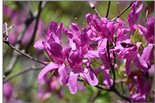
Lilac Lights Azalea flowers