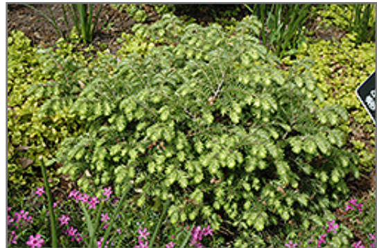
Moon Frost Hemlock

Moon Frost Hemlock is recommended for the following landscape applications;