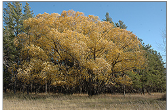
White Willow in fall