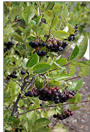
Iroquois Beauty Black Chokeberry fruit