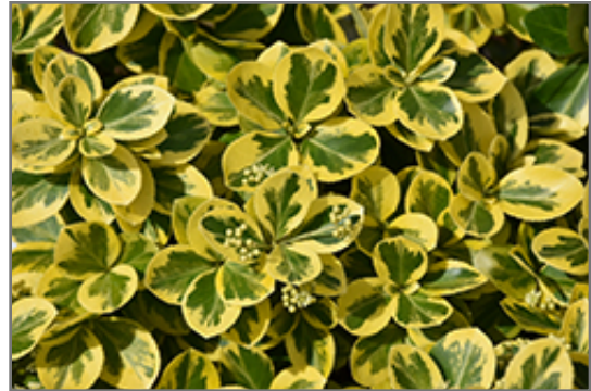
Gold Splash Wintercreeper flower buds

This shrub performs well in both full sun and full shade. It is very adaptable to both dry and moist locations, and should do just fine under typical garden conditions. It is not particular as to soil type or pH. It is highly tolerant of urban pollution and will even thrive in inner city environments, and will benefit from being planted in a relatively sheltered location. This is a selected variety of a species not originally from North America.