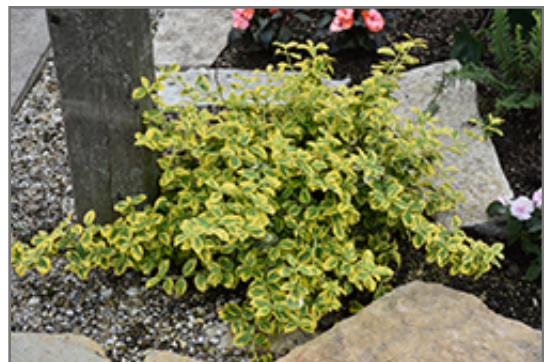
Gold Splash Wintercreeper