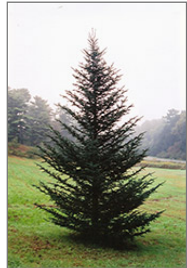
Fraser Fir