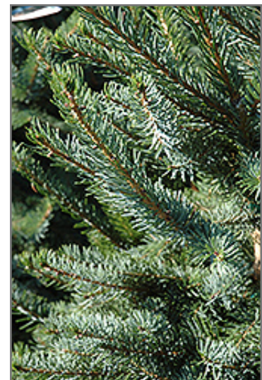
Bruns Spruce foliage