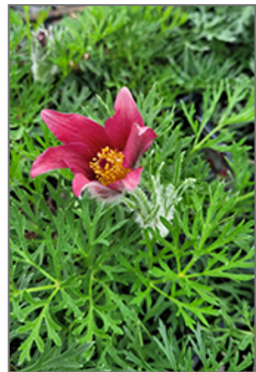
Red Pasqueflower flowers