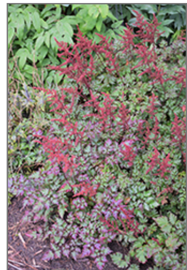
Delft Lace Astilbe in bloom