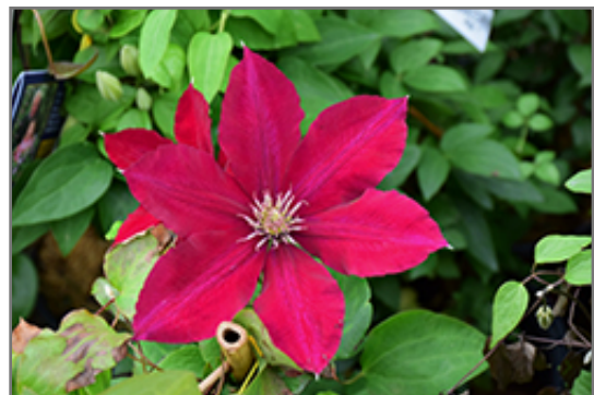
Rebecca Clematis flowers