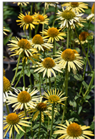
Maui Sunshine Coneflower flowers