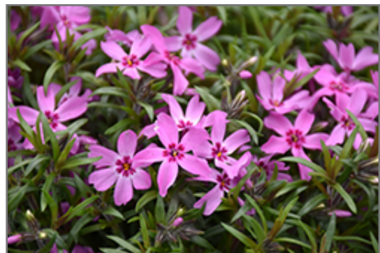
Crimson Beauty Moss Phlox flowers