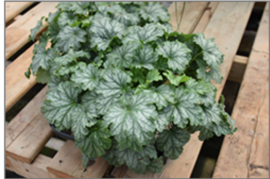
Paris Coral Bells foliage

Paris Coral Bells will grow to be about 8 inches tall at maturity extending to 14 inches tall with the flowers, with a spread of 14 inches. When grown in masses or used as a bedding plant, individual plants should be spaced approximately 12 inches apart. Its foliage tends to remain low and dense right to the ground. It grows at a medium rate, and under ideal conditions can be expected to live for approximately 10 years. As an evergreen perennial, this plant will typically keep its form and foliage year-round.