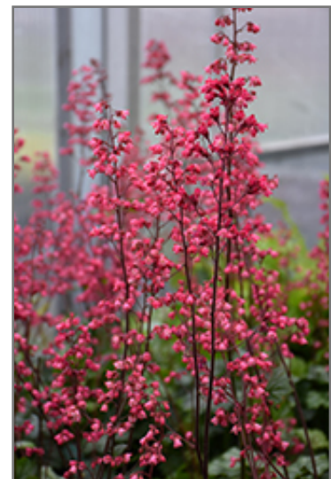
Paris Coral Bells flowers