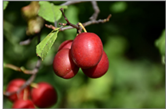
Toka Plum fruit