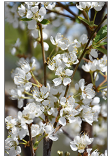
Toka Plum flowers