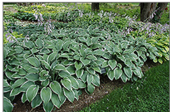
Winter Snow Hosta in bloom