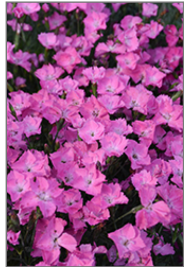
Beauties Kahori Pink Pinks flowers

Beauties Kahori Pink Pinks is recommended for the following landscape applications;