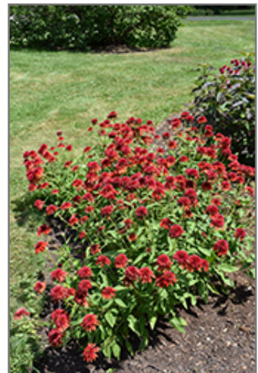
Double Scoop Orangeberry Coneflower in bloom